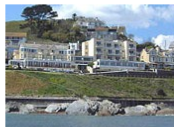
Hannafore Point Hotel

The Hannafore Point Hotel Marine Drive, West Looe Cornwall, PL13 2DG Tel: 01503 263 273 Web: www.hannaforepointhotel.com