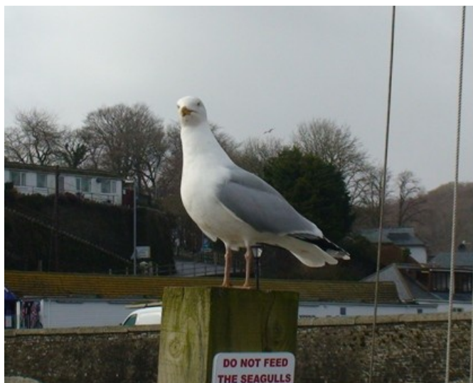
A Seagull on top of a post in the harbour. The sign says: Don't feed the seagulls. They are vicious!

After a leisurely breakfast those who need an extra dance fix are invited to arrange private lessons by appointment (these slots are limited).